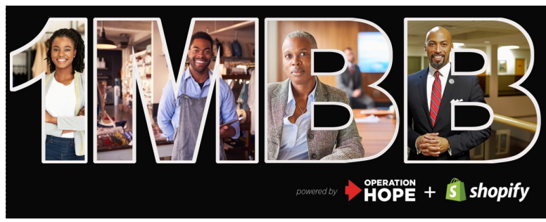
Click image to view video

Operation HOPE (OH) and Shopify are leading the way of fundamentally changing the land-scape of the U.S. economy and the Black business ecosystem. Last week, during the HOPE Global Forums and Annual Meeting, we announced our newest, most ambitious project yet — HOPE 1 Million New Black Businesses & New Black Entrepreneurship Initiative (1MBB). With a massive near $130 million dollar commitment from leading global commerce company, Shopify, we are aiming to help create and support one million Black-owned businesses in the U.S. by 2030. OH & Shopify are dedicated to the health, vibrancy, and vitality of America's business ecosystem and will help create opportunity and wealth within the Black American community for generations to come.